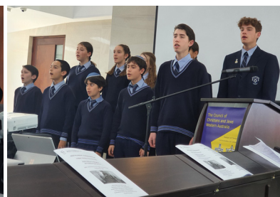
Carmel Choir.