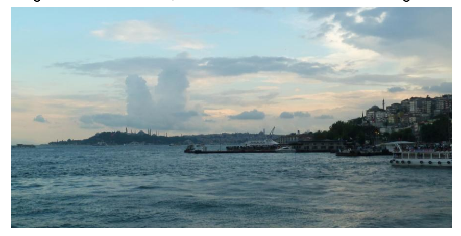
Commencement of the boat cruise on the Bosporus at the conclusion of the ICCJ conference

On Wednesday morning, instead of workshops, there was a choice of panel discussions, the first on "Turkey and Europe", the other on "Religion and State: The Turkish experiment, freedom or failure?" I chose the latter, which turned out to be an extraordinary experience. Organisers had faced great difficulty in obtaining the two Turkish presenters required for the panel, and then had been informed that morning that one of these had suddenly become ill the evening before. As a result, the format was changed, and the session consisted primarily of a very disturbing presentation by the other Turkish panelist. It became evident that the government exercises considerable control over religious communities, and this was confirmed during the discussion which followed. The session