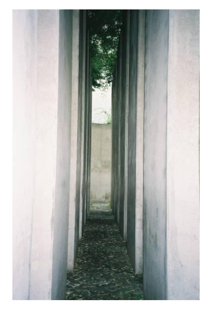
View of Bundestag (Parliament) from the Holocaust Memorial, Berlin